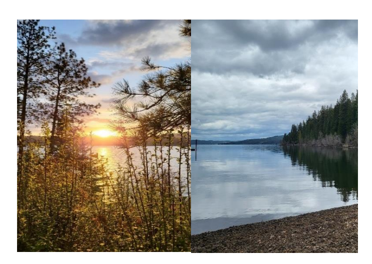
Deck below with rocking chairs, looking over the lake above!

The nominal Adventists will not be able to refute the Sabbath any more than they can refute sanctification of which the Sabbath is a sign. If the Bible and the Bible only is used, no one need be confused in regard to those two vital doctrines. The Bible is so clear on those two teachings that anyone may understand them if they have a genuine desire to know and understand. "Don't trust any living man to interpret the Bible for you." Faith and Works , p. 77. ......To Be Continued.