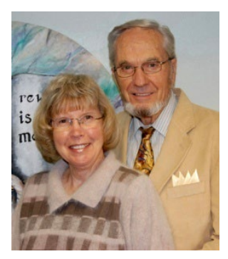
Bible Explorations, Inc. 1279 W Henderson Ave PMB# 317 Porterville CA 93257

1-877-475-1318 www.BibleExplorations.com